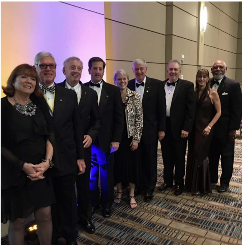
HHI Rotary Club Past Presidents (L to R):